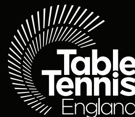
Table Tennis England Junior Umpire Award TEST PAPER